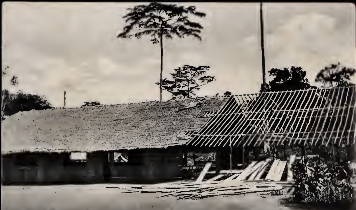
ENLARGING LOLODORF CHURCH, KAMERUN, WEST AFRICA. 13788.